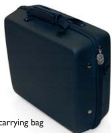
78 20 10 Semirigid carrying bag