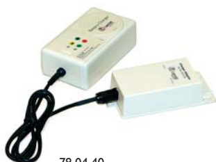
78 04 40 External charger kit