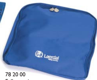
78 20 00 Full covering carrying bag