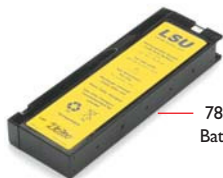
78 04 00 Battery