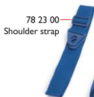
78 23 00 Shoulder strap