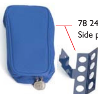
78 24 00 Side pouch