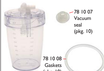
78 10 07 Vacuum seal (pkg. 10)